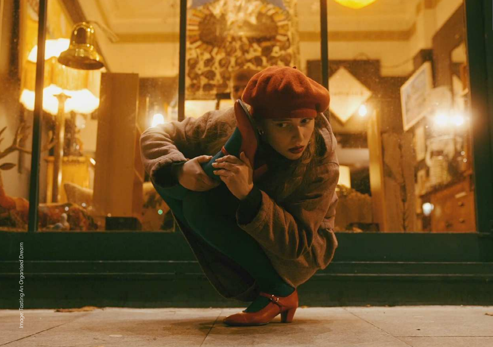
Image: Tasting An Organised Dream